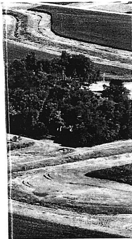
Tree and windbreak plantings, areas of native grass and generous grass buffer strips along drainage ditches illustrate the emphasis that the Dahl family places on environmental stewardship.